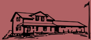
BEISEKER STATION MUSEUM

Artifacts, photos, stories & pop corn too!