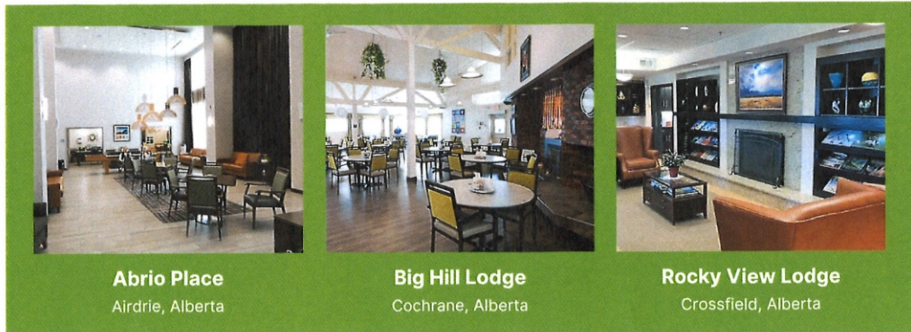
Abrio Place Airdrie, Alberta

Rocky View Foundation also operates three Seniors Lodges for individuals aged 65+ who would benefit from a supportive living environment while maintaining their independence. Lodge living includes meals, housekeeping, social activities, and 24-hour non-medical staff for added peace of mind. If you are interested in learning more or would like to have your name added to a waiting list, please contact the lodges directly for more information.